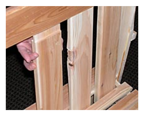
Install the backrest slats.

6. Place a slat at each end of the top rail 1 1/2" in from the end of the rail. Secure the slats by gluing the tenons into the rail's groove and driving 4d finish nails through the slat into the rear 1 1/2" seat slat.