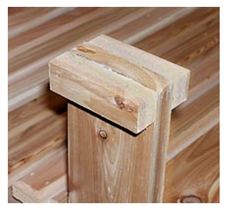
Attach cleats to both sides of each front upright.