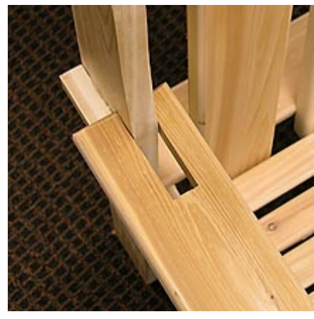
Test fit the armrest.

7. Test fit the armrest. The notch should fit around the back rail with the wide tail over the back cleat. The front of the armrest should overhang the front rail by 3/4" to 1".