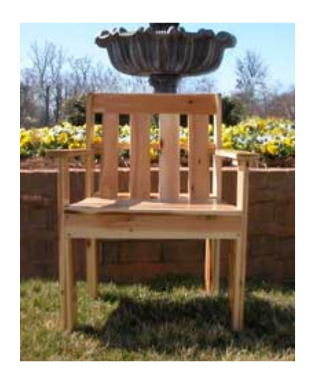
This chair is so comfortable, you'll want to build a whole set.

Enjoy the beauty of the great outdoors from the comfort of a chair you build yourself. This chair is great for lounging on a relaxing afternoon, reading or adding entries to your daily journal. You can build the chair exactly as specified in our instructions, scale it down for a child or change the measurements to create a fully customized outdoor lounging experience.